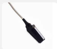
50L60EAV 4-6MHz Rectal Transducer