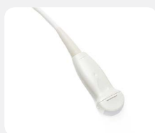
35C20EA 2-5MHz Convex Transducer