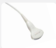
35C50EA 2-6MHz Convex Transducer