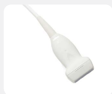
75L38EA 5-10MHz Linear Transducer