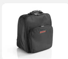
Padded Carry Bag