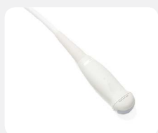
65C15EA 5-8.5MHz Convex Transducer