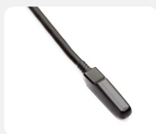
75L50EAV 5-10MHz Rectal Transducer