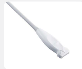
L25x 13-6MHz 25mm Linear Array