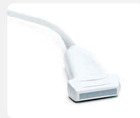
HFL38x 13-6MHz 38mm Linear Array