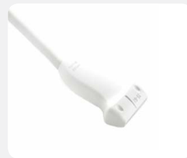
HFL50x 15-6MHz 50mm Linear Array