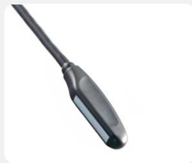
L52x 10-5MHz 52mm Linear Rectal