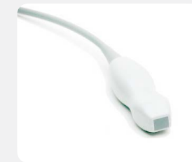
P10x 8-4MHz 10mm Phased Array