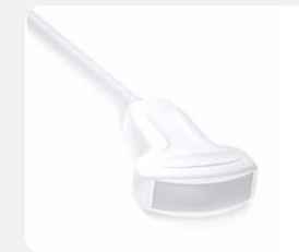
C60x 5-2MHz 60mm Convex Array