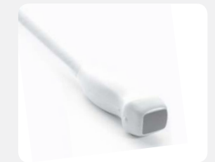
P21x 5-1MHz 21mm Phased Array