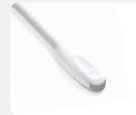
C11x 8-5MHz 11mm Micro Convex Array